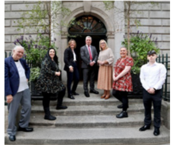
Hello Goodbye Event 2024 with Mary MacAleese welcoming new ambassadors and saying goodbye to old.

The impact of the LEAP programme has been, and continues to be transformational for Focus Ireland. A number of the ambassadors now sit on the organisation's advisory committee and have attended board meetings to ensure that the lived experience of homelessness remains at the centre of Focus Ireland's activities.