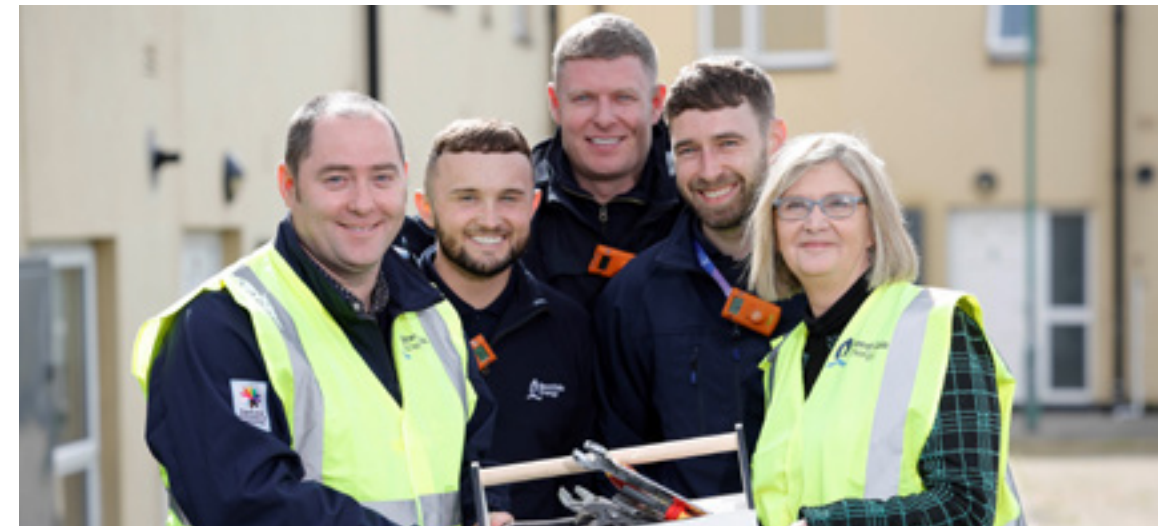
Phase 1 of the Aylward Green heating upgrades

potential, fostering equality, respect, and confidence within their communities.