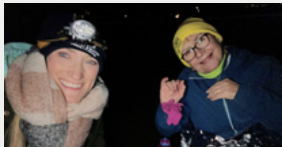
Colleagues braving the elements at Shine A Light

homelessness is not forgotten, Bord Gáis Energy expanded its partnership with Focus Ireland by becoming the lead sponsor for the Shine A Light flagship event in 2018. This was motivated by a desire to deepen the impact of our support for Focus Ireland as well as to encourage other companies to get involved in the event.