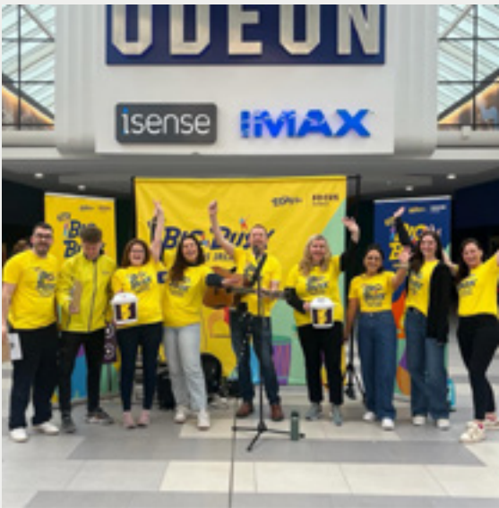
Volunteers fundraising at the Big Busk 2024

Individual volunteers can make a real difference. Members of our Customer Operations team spent a day batch cooking healthy and nutritious meals to be utilised by Focus Ireland customers within the Family Centre. The meals were created with all dietary requirements in mind and catered to a wide variety of diets such as gluten free, halal etc.