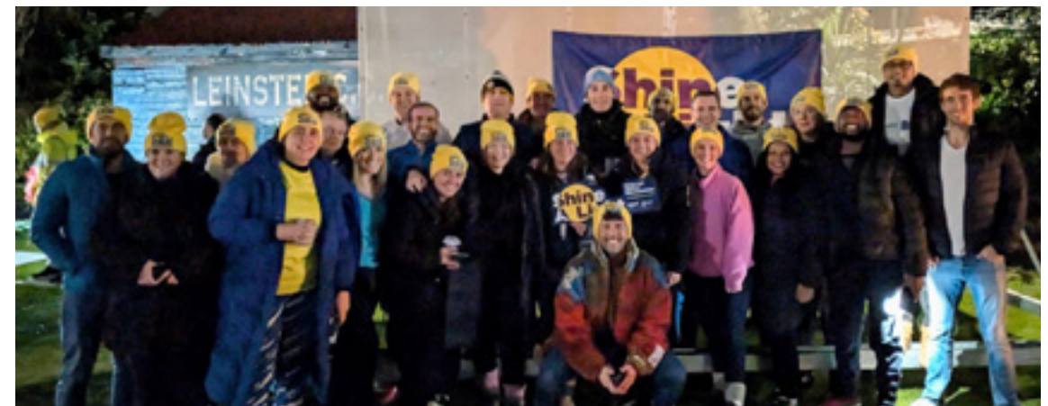
Bord Gáis Energy colleagues at the 2024 sleep out