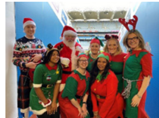
Volunteers at the 2023 Christmas Day