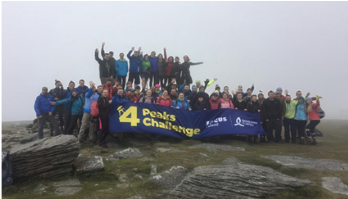
Four peaks challenge 2019

15,580 total people homeless, with even more people at risk. Over 500 families have become homeless in the past two years alone. Over 4,600 children don't have a home.