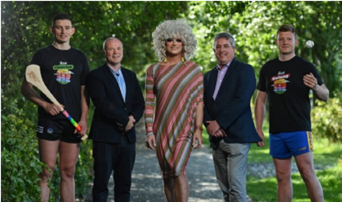
State of Play campaign promoting inclusion in sport 2022

One of the highlight initiatives of 2024 was Focus Ireland’s Voter Registration Drive, launched in the run-up to the local elections. The aim was to support people who are experiencing homelessness in registering to vote. This empowered them to have their voices heard and their vote counted at the ballot box, ultimately to drive political change and help end the housing and homelessness crisis. Bord Gáis Energy got involved in the campaign and five volunteers completed a 90-minute training session on voter registration and subsequently attended voter registration drive sites organised by Focus Ireland.