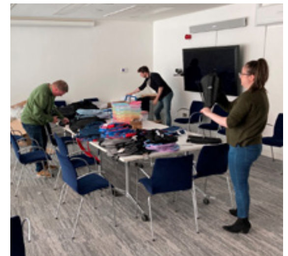
Supporting students with the Back to School backpacking initiative 2024

Our Women's Network has supported the development of Focus Ireland's Women's Network, promoting dignity and empowerment for women and families. We've backed the Family Centre through donation drives and visits to connect with the work on the ground. Each year, we run a women-focused pop-up shop at the café, offering clients a warm and dignified experience. In 2024, we helped relaunch the Women's Philanthropy Circle, supporting youth homelessness through fundraising and events.