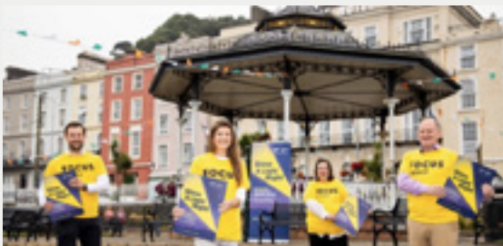
Launching Shine A Light in 2020

If real progress is to be made on tackling the homelessness crisis, the issue must be kept at the forefront of the public consciousness. Family homelessness is often unseen and therefore too easily forgotten. At the same time, the demands on Focus Ireland's resources are increasing every year in line with the rise in the number of people experiencing homelessness.