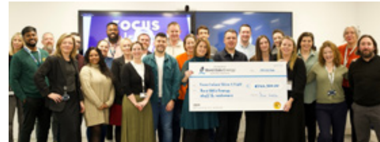
Bord Gáis Energy team presenting cheque for colleague fundraising efforts – 2024

In addition, volunteers from across Bord Gáis Energy head outdoors with their sleeping bags each year to spend a night under the stars in solidarity with people who are experiencing homelessness.