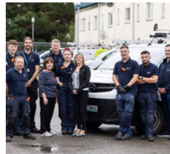
Phase 2 of the Aylward Green heating upgrades

The collaborative effort was hands-on and involved regular communication to fully understand the needs on the ground. It also required joint planning and close coordination between Bord Gáis Energy's engineers and apprentices and Focus Ireland's housing team to ensure the work was delivered smoothly and respectfully.