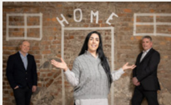
Launch of the LEAP programme 2022

Focus Ireland successfully established the Lived Experience Ambassador Programme (LEAP) in 2022 – sponsored by Bord Gáis Energy from the outset. This innovative project, the first of its kind in Ireland, helps to empower people with first-hand experience of homelessness to tell their stories, inform policymakers and advocate for other people experiencing homelessness.