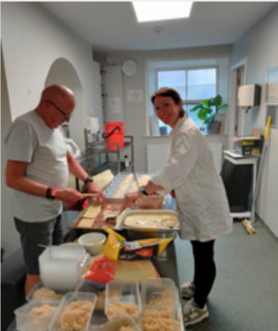
Cooking up a storm

One of Focus Ireland’s more high-profile fundraising events is The Big Busk where seasoned buskers and other musically talented individuals and celebrities take to the streets to raise funds and raise awareness of homelessness. Between 20 and 30 Bord Gáis Energy volunteers support their efforts each year by joining the national campaign and encouraging the public to donate.