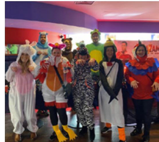
Volunteers at the Easter cinema day