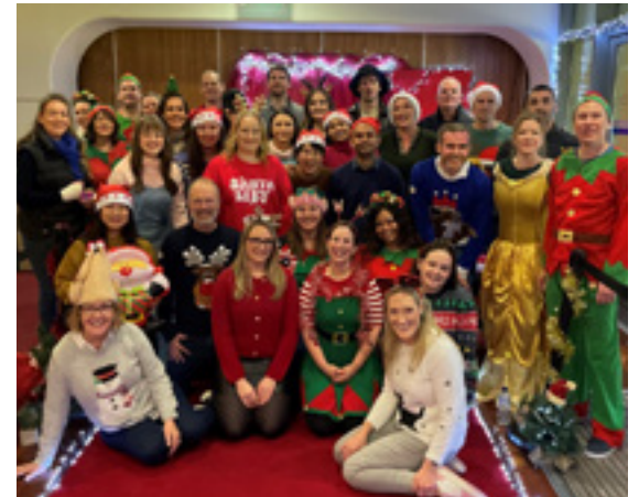
Volunteers at the 2023 Christmas Day

For many of the families supported by Focus Ireland, the highlight of the year is the Family Christmas Party in Croke Park. Every December, up to 50 colleagues volunteer their time to help create a magical winter wonderland – from setting up the space and coordinating logistics to dressing as Santa's helpers. Families enjoy a full Christmas dinner with all the trimmings, take part in party games, let their hair down on the dance floor, visit Santa's grotto, and leave with a present.