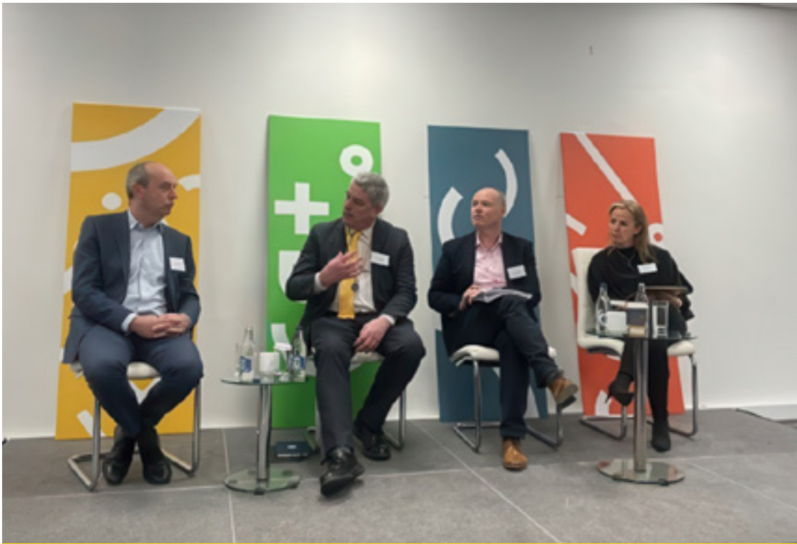
IBEC panel discussion 2023