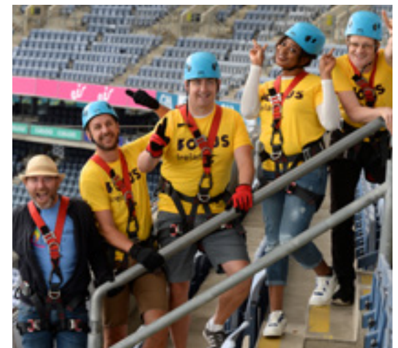
Croke Park abseiling fundraising 2023