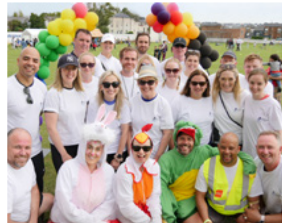
2023 volunteer led family sports day

When you don't have a garden or even a neighbourhood to play in with friends, taking part in fun sports games is not always possible. Each year Bord Gáis Energy and Focus Ireland organise a Summer Sports Day to welcome families and children in Dublin, and soon Cork, to play, interact and take part in the friendly competition of sports. The Sports Day is always an incredibly enjoyable experience with the fun capped off by ensuring each child leaves with a medal. These events wouldn't be possible without the dedication and support of a fantastic team of 50 Bord Gáis Energy volunteers.