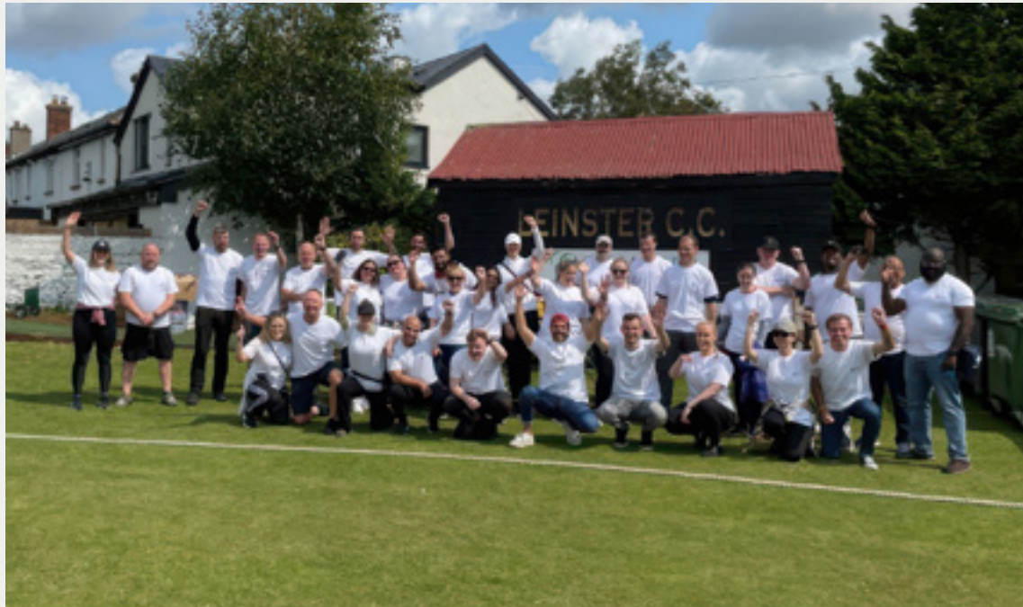
Summer sports day 2023