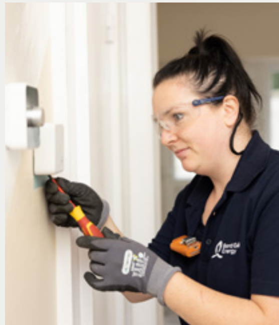
Bord Gáis Energy colleague installing a smart heating control system at Aylward Green

The primary goal is to offer temporary accommodation while helping families develop the skills needed for independent living. The service aims to empower individuals and families to reach their full