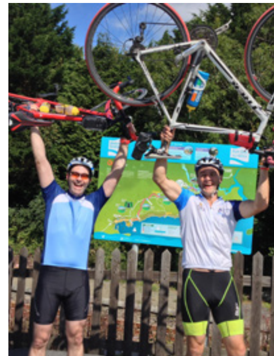
Cork to Dublin cycle 2017

What does matter is the impact: the smile on a child's face when they get their present from Santa at the Christmas party or a medal at the summer sports day